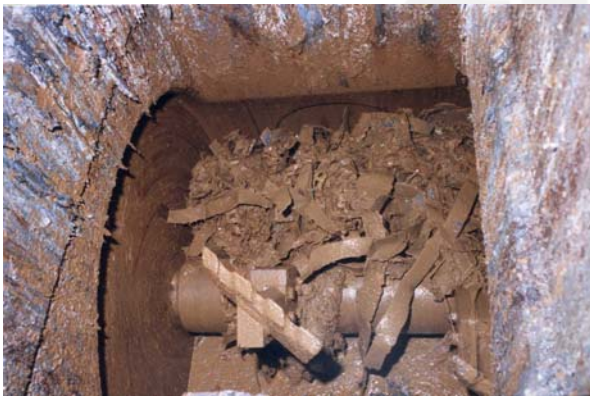
View into a running AVA 10 m3 mixer: Hazardous waste, during the mixing process after treatment by means of rotary cutter

The simultaneous mixing and buffering of an input quantity of up to two hours – based on the throughput performance of the incineration plant - means that one is also independent of, for example, operating errors and delays during the charging of the plant. This means that the incineration plant is able to run 24 hours a day at highest throughput performance and at highest efficiency. The actual homogenisation of the waste is achieved by means of a single shaft mixer which is equipped with an adjustable weir. Charging flanges on the mixer can be used to add liquid waste into the mixing process. The addition of nitrogen prevents the creation of an explosion-prone atmosphere, which is also continuously monitored for safety reasons.